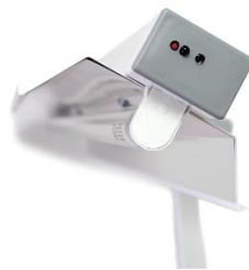
Digital counter with acoustic signalling, without the display